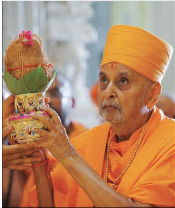
Swamishri holds the auspicious kalash as part of the mahapuja ceremony