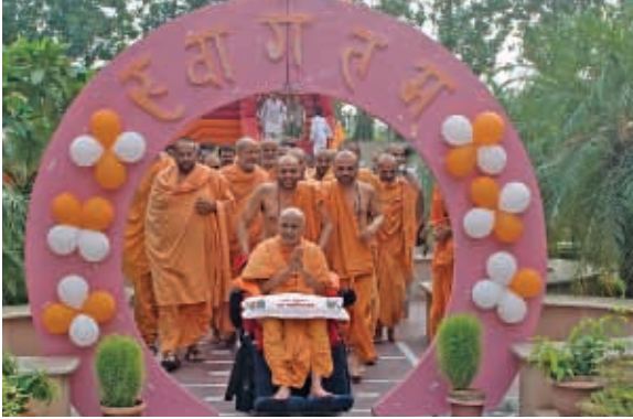
Swamishri on his way to perform morning puja on Bal Din, Delhi