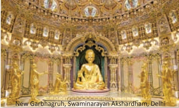
New Garbhagruh, Swaminarayan Akshardham, Delhi