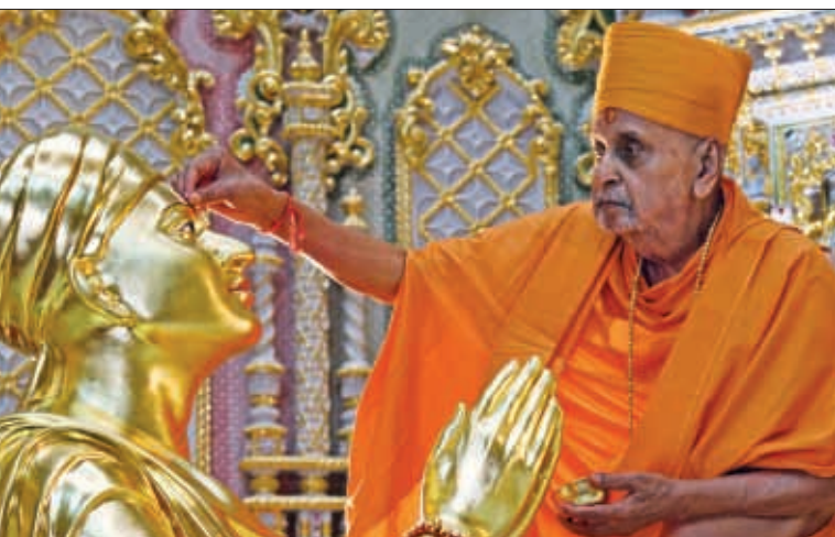
Swamishri performs puja of Aksharbrahman Gunatitanand Swami

Swaminarayan Akshardham in New Delhi represents Pramukh Swami Maharaj's unparalleled devotion to Bhagwan Swaminarayan and fulfils Brahmaswarup Yogiji Maharaj's long-cherished wish for such a tribute to Bhagwan Swaminarayan in the nation's capital. Since its opening in November 2005, over 20 million pilgrims and visitors from throughout the whole of India and over 130 countries have been inspired by their experience at Swaminarayan Akshardham: the divine murti of Bhagwan Swaminarayan, exhibitions displaying his motivating messages and the story of Indian culture.