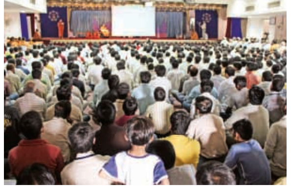
Devotees during a satsang assembly, New Delhi