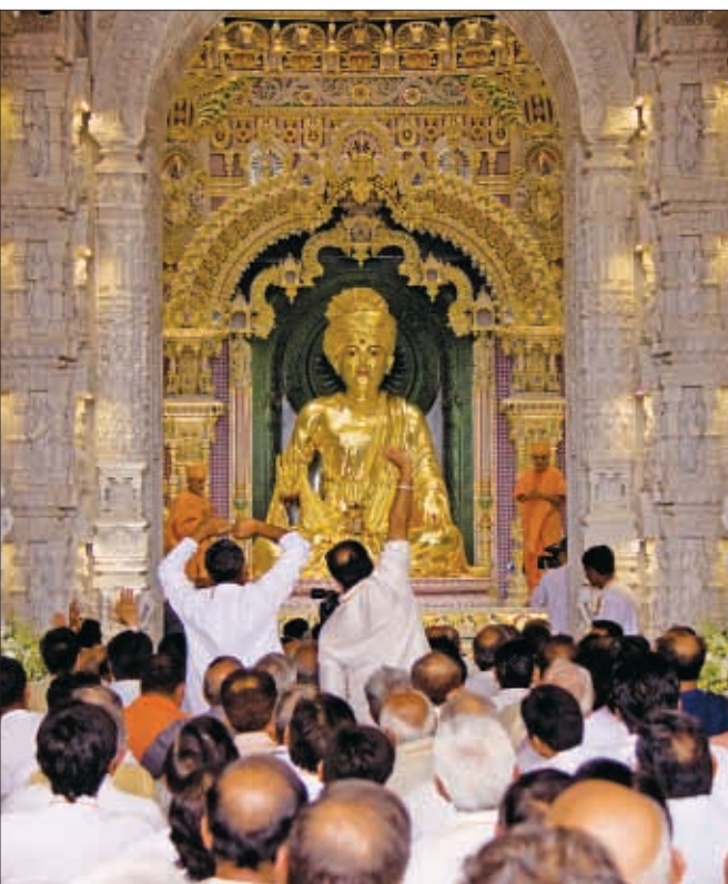
Devotees enthusiastically hail the jay naad of Bhagwan Swaminarayan and the guru parampara

one to be treasured in the memory for life.