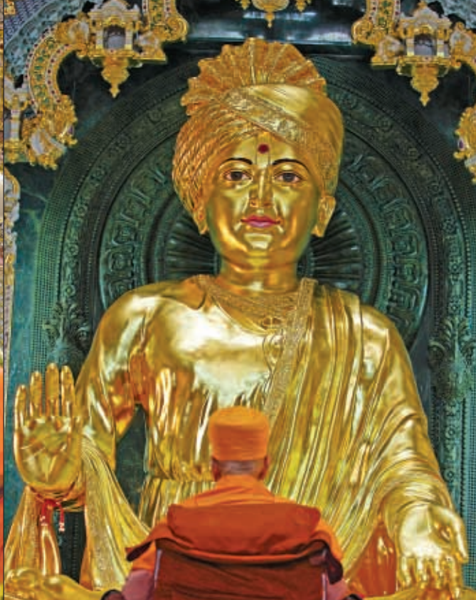
Swamishri engrossed in darshan before the divine and serene murti of Bhagwan Swaminarayan