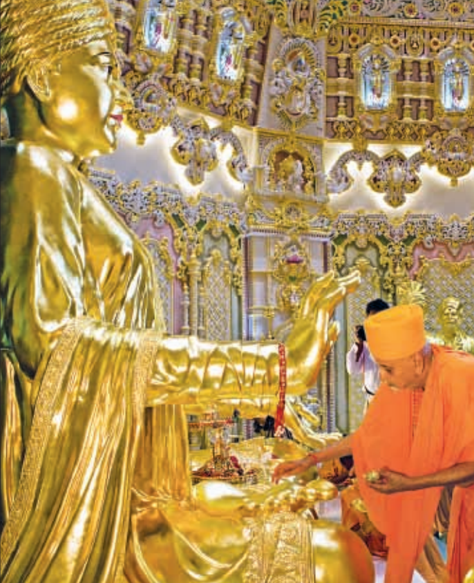
Swamishri performs pujan at the feet of Bhagwan Swaminarayan