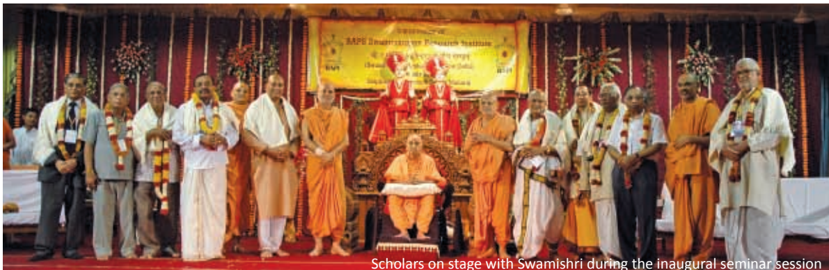
Scholars on stage with Swamishri during the inaugural seminar session

4 July 2010, Swaminarayan Akshardham, New Delhi